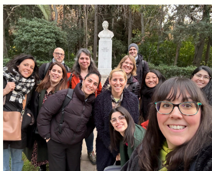
Learning oportunitie in Athens

KEAN, partners from Athens, that host 2nd transnational project meeting, therefore showed consortium an example of how the HerStory map tour could look in practice.